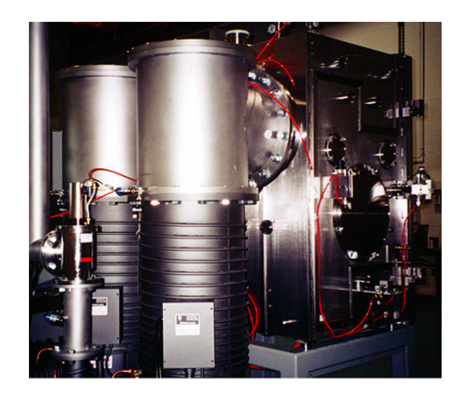
Figure 4 Vacuum diffusion pumps in operation, here in a vacuum coating operation.